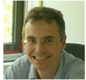
Coauthor Angel Rubio

Finally, applications to infinite and finite systems, a list of FAQ, and three appendices conclude the paper. The last appendix contains, in a nutshell, the idea that it should be possible to derive, from the BSE scheme, an exchange-correlation kernel to be used in TDDFT.