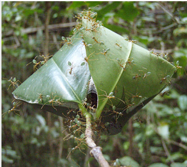
FIGURE 3 DESCRIPTION:

Green tree ants, Oecophylla smaragdina , defending their nest in Cape Tribulation, Australia. These ants use their larvae to sew together leaves to construct their nest enclosures.