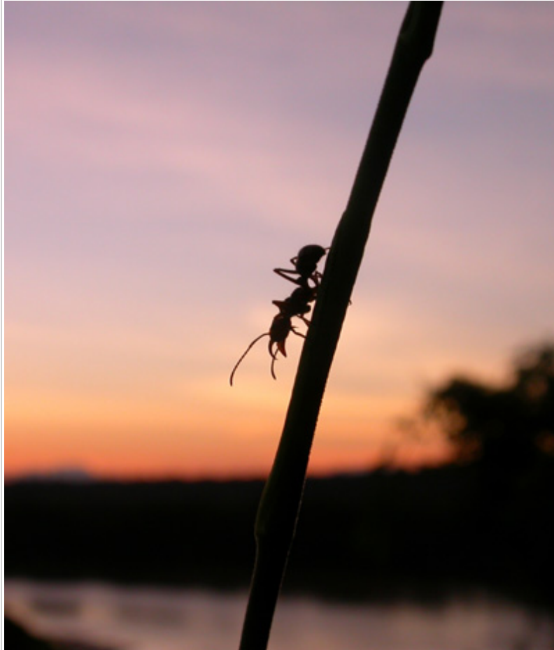
FIGURE 2 DESCRIPTION:

An ant of the genus Ectatomma foraging at sunset in the Peruvian rainforest.